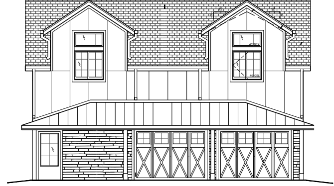
1 GUEST HOUSE - FRONT ELEVATION (EAST) SCALE: 1/4" = 1'-0"