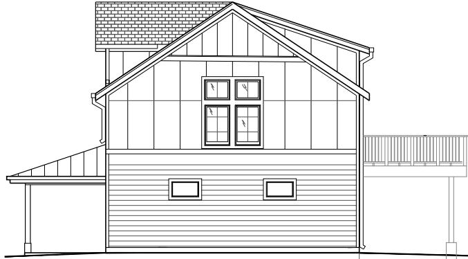
2 GUEST HOUSE - RIGHT ELEVATION (NORTH) SCALE: 1/4" = 1'-0"